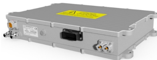
HPC series on-board battery charger by EDN

MTA S.p.A. is a global leader in the development and production of a wide range of electromechanical and electronic products developed internally for the primary manufacturers of cars, motorcycles, tractors, and heavy vehicles. Founded in 1954, MTA has two production sites in Italy (Codogno and Rolo), 8 foreign sites, a turnover of €187 million and 1,640 employees.