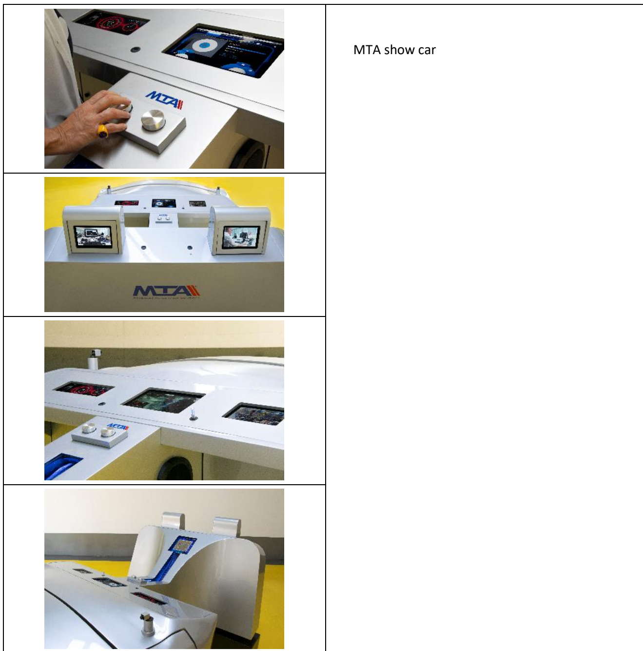
MTA show car

MTA S.p.A. is a global leader in the development and production of a wide range of electromechanical and electronic products developed internally for the primary manufacturers of cars, motorcycles, tractors, and heavy vehicles. Founded in 1954, MTA has two production sites in Italy (Codogno and Rolo), 8 foreign sites, sales of about €198 million, and 1,330 employees.