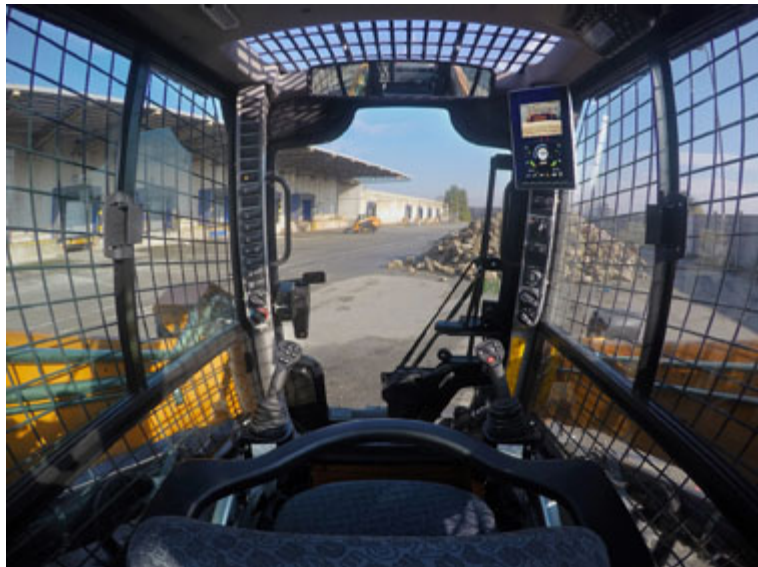
Black Hawk display by MTA mounted in CASE new B Series of loaders