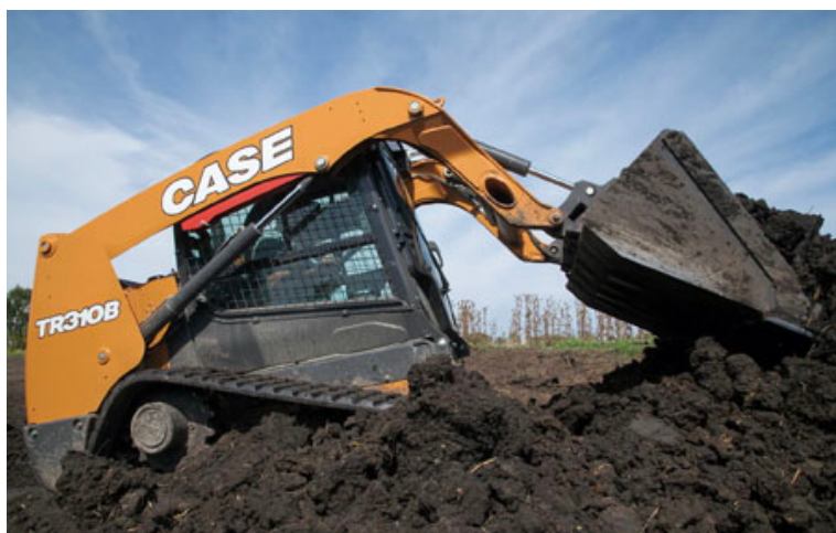
The new B Series of CASE compact track loaders.

MTA S.p.A. is a global leader in the development and production of a wide range of electromechanical and electronic products developed internally for the primary manufacturers of cars, motorcycles, on and off-highway vehicles. Founded in 1954, MTA has two production sites in Italy (Codogno and Rolo), 8 foreign sites, sales of about €203 million, and 1,550 employees.