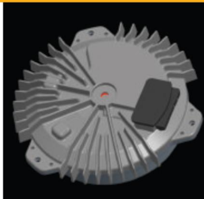
Spal's new 2-kW brushless drive with 48-V sealed and spark-free electric motor.

According to SPAL the new brushless system has a drive efficiency of 90%, measured during a test at 25 °C temperature and a speed of 3,000 r/min.