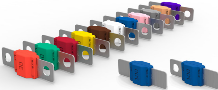
Clinched version available